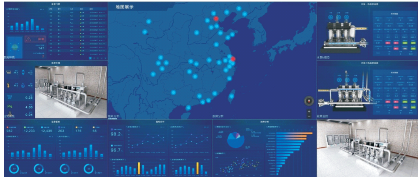
远程监控系统界面 Remote monitoring system interface

(5) frequency conversion control, remarkable energy saving: real time monitoring of pump room equipment operation, reasonable arrangement of pump start and stop, to maximize energy saving.